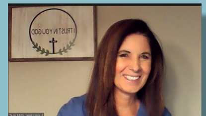
My life on Zoom!