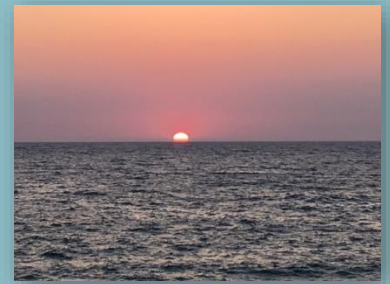
Sunset over the Aegean Sea