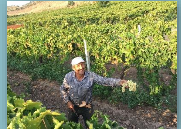
The gracious Vinedresser