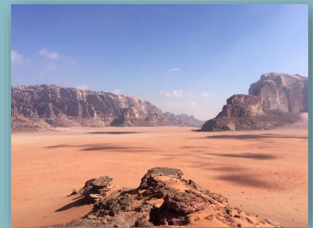
Wadi Rum, Jordan

When we don’t know what we don’t know, we end up thinking that we know. I have become increasingly aware I should talk less and let those who really know ( not just think they do ) impart their wisdom. Jesus does not know the day or the hour the Father is planning for His