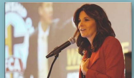
FCA Home Team Dinner