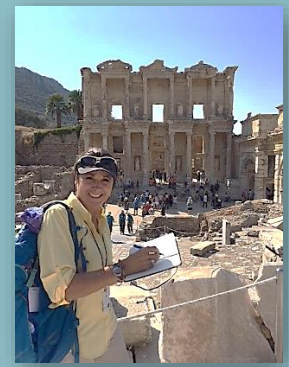
Studying at the Ephesus library