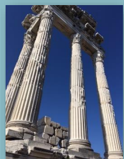
Hierapolis & Pergamum