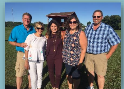
Friends...one of life's greatest joys!