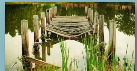
God mends broken bridges.