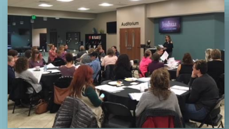
Our weekly study of Joshua.