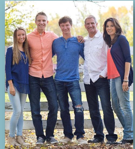
The vision of a family healed.