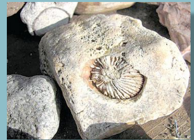
Bear His imprint