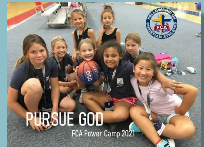
My FCA Camp Huddle

Let's continue to turn to the Lord with all our questions and our doubt, believing He will bring restoration in His perfect time.