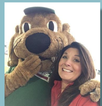
RailCats Baseball Game