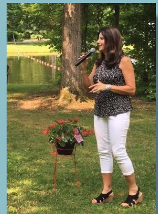
TriPonds Summer Concert

For contact info, event details, audio teaching files & to donate, visit: