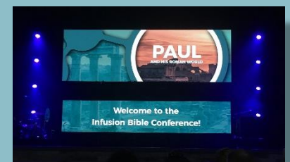
Infusion Bible Conference