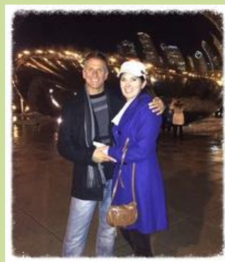
My husband chases after God's heart!