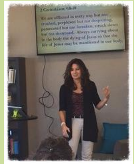
Our Women of the Word study.