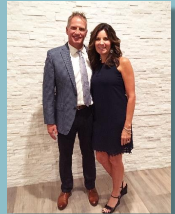
We Trust in You God!