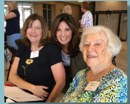
Smiles at our women's study